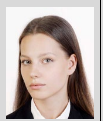
Subject's face is turned