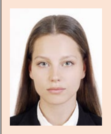
The photo meets all the requirements and shows the subject clearly.