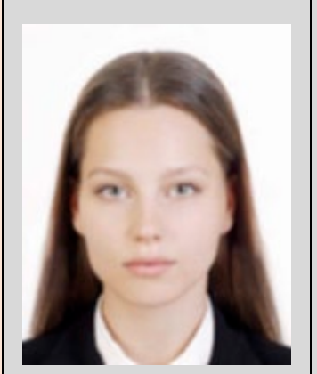
Subject is blurry or out of focus