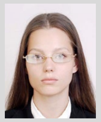
Subject's glasses are reflecting light