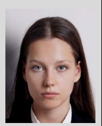
Shadows in the background